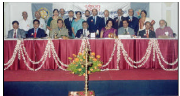
ROTARY CLUB OF MAPUCA – LEAVING BEHIND FOOTPRINTS ON THE SANDS OF TIME !

The room was as dark as the darkest night and the 175 participants from 12 Districts in South East Asia were blind-folded with black and red silk eye masks.