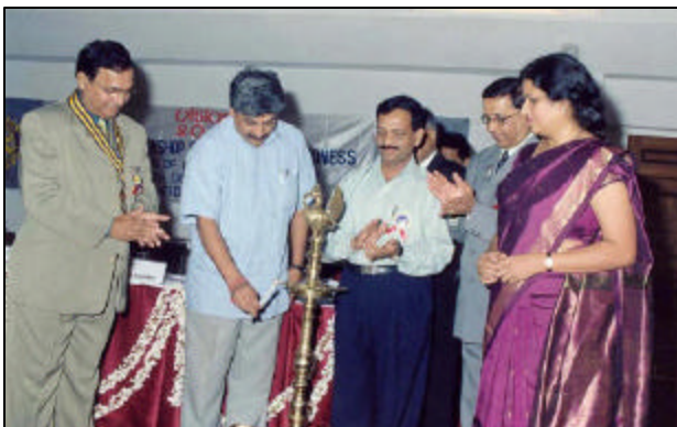
LET THE LIGHT SHINE FORTH ! THE HON'BLE CHIEF MINISTER INAUGURATING THE SEMINAR BY LIGHTING THE TRADITIONAL LAMP !